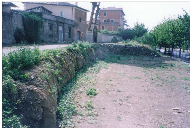
Figure 8. Tufa bank in front of the entrance to the “Villa Certosa.”