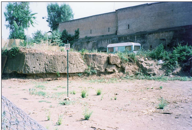
Figure 6. Tufa bank cut away from the street level and new “Private Property” sign in front of the “Villa Certosa.”