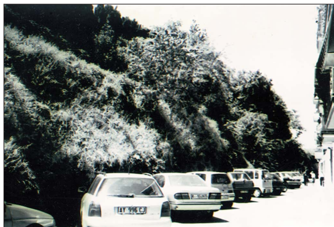
Figure 5. Remnants of the “Monte d’Oro” beside the via Casilina opposite the “Villa Certosa.”

than that of the original consular road. 42 It had also narrowed as it continued down the steep slope between the vineyards of the Apollonj-Ghetti (Monte d’Oro) at left, and Villa Certosa on the right. 43 (Figures 6–8)