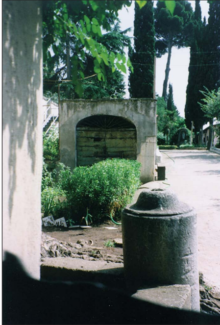
Figure 9. Entrance into subterranean area on the grounds of the “Villa Certosa.”