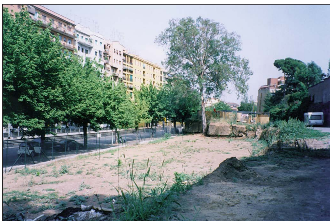
Figure 3. Panorama of the via Casilina, with apartments, tram line, and clearing in front of entrance to the “Villa Certosa.”