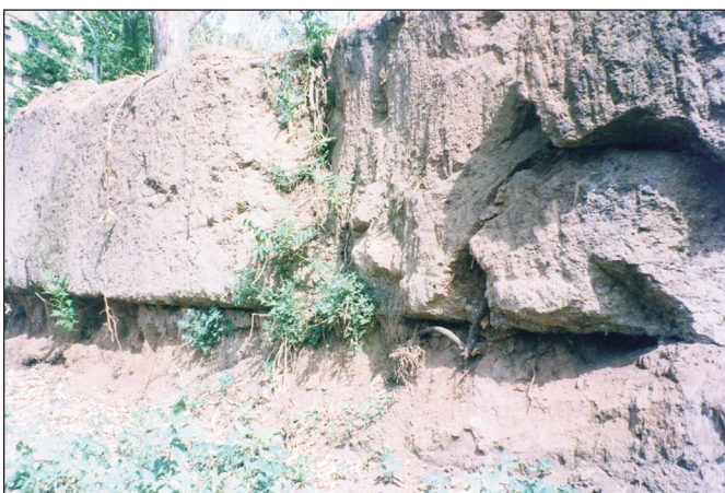
Figure 7. Geological strata of the “Monte d'Oro” in front of the entrance to the “Villa Certosa.”

officials and tolerated by the antiquarians, who valued artifacts, but left no description of their provenance. 48