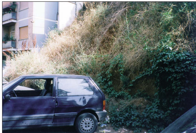
Figure 4. Remnants of the “Monte d’Oro” beside the via Casilina opposite the “Villa Certosa.”