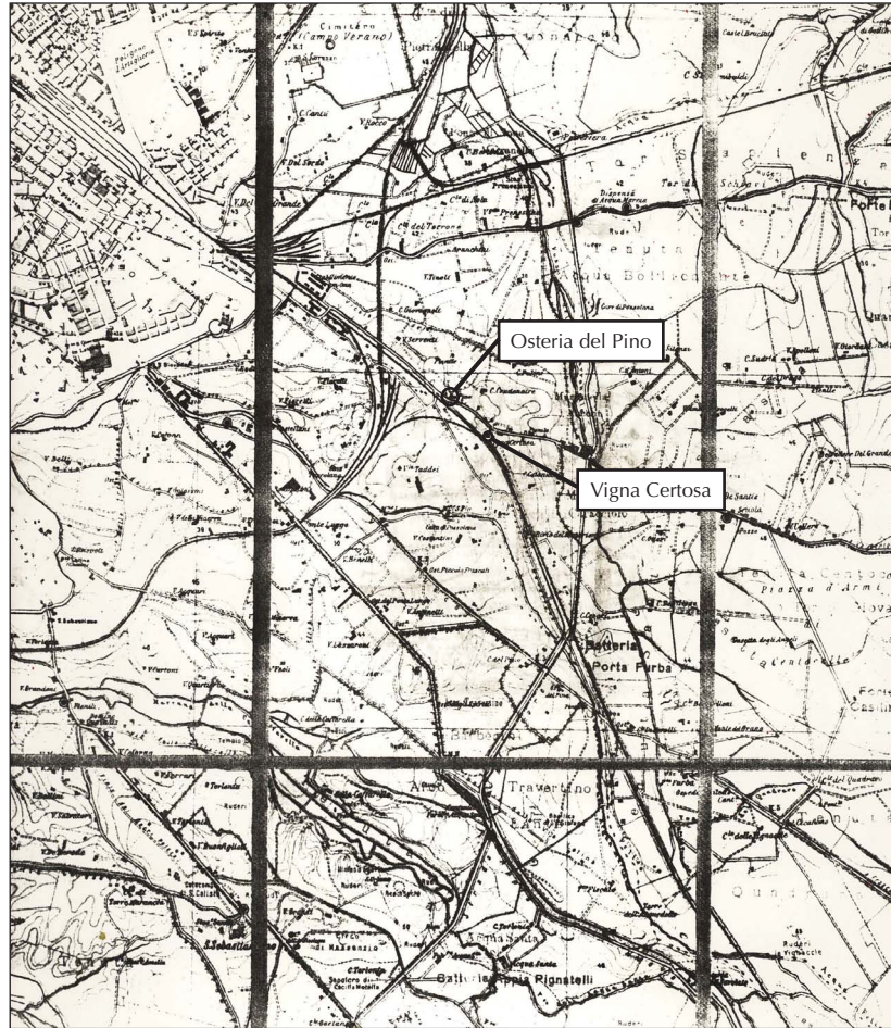
Figure 11. The location of the Osteria del Pino on a 1906 map of the Roman suburbs and countryside by the Istituto Cartografica Italiana. A. Frutaz, Le Pianta di Roma , 3, 1962, pl. 573, n. 222

covery of the Labicana catacomb, Marucchi was working on another Jewish catacomb on the via Appia: O. Marucchi, "Scavi nella vigna Randanini," Chonachetta mensuale 3.2 (1882): 180–190; and Breve guida del cimitero giudaico di Vigna Randanini , Rome, 1884. The Vigna Randanini catacombs are located between the via Appia Antica and via Appia Pignatelli, about two and a quarter miles outside of the old city walls of Rome. Marucchi's studies (1882–1884) were carried out while the landowners were excavating and restoring areas close to the entrances into the catacomb in order to reopen the site to the public (closed since the early 1870s in a pending suit over the illegal sale of artifacts). The Randanini excavations were privately conducted and funded—although Marucchi and the German scholar Nicholas Muller published individual finds from the site.