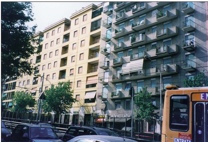
Figure 2. Apartments constructed on the site of the “Monte d’Oro” on the via Casilina.