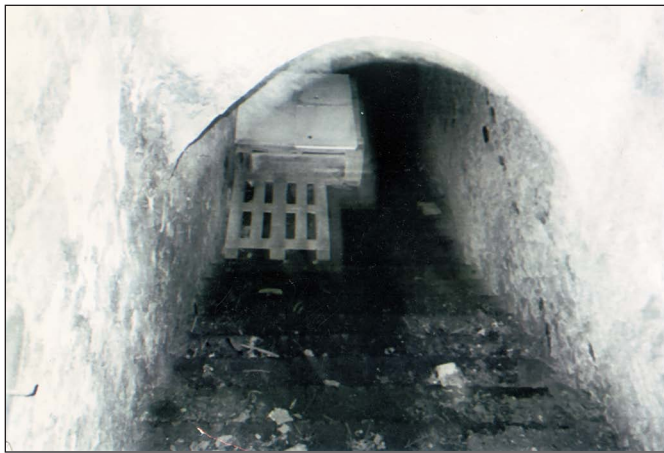
Figure 10. View into the stairwell of preceding image on the grounds of the “Villa Certosa.”